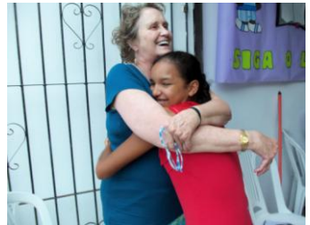
VBS at the Abelhinha school